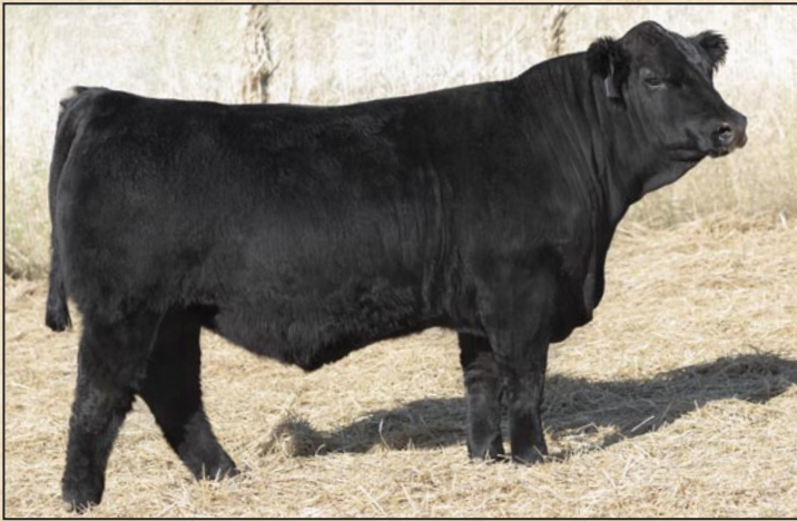
CLRS HARLEY DAVIDSON 608H