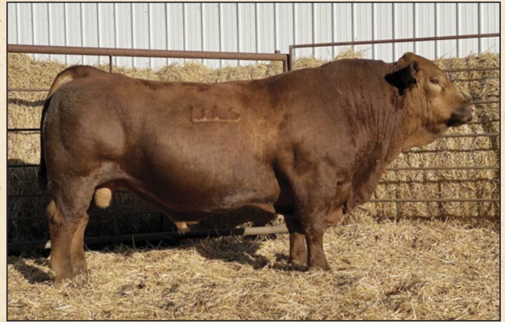
WS FRANK 105F